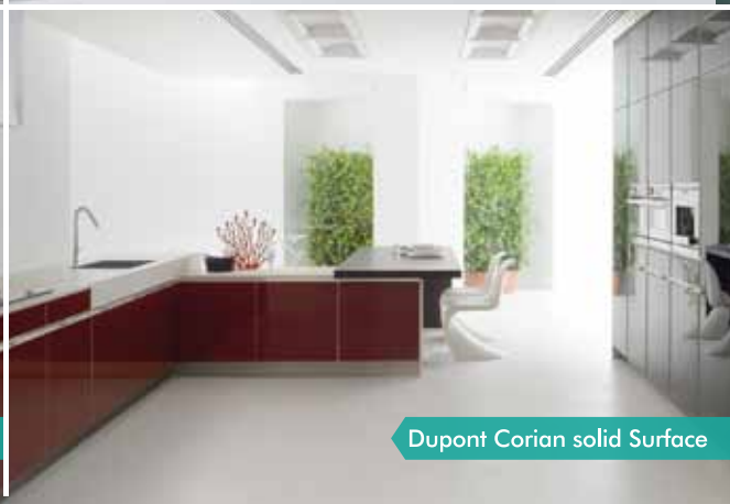
Dupont Corian solid Surface