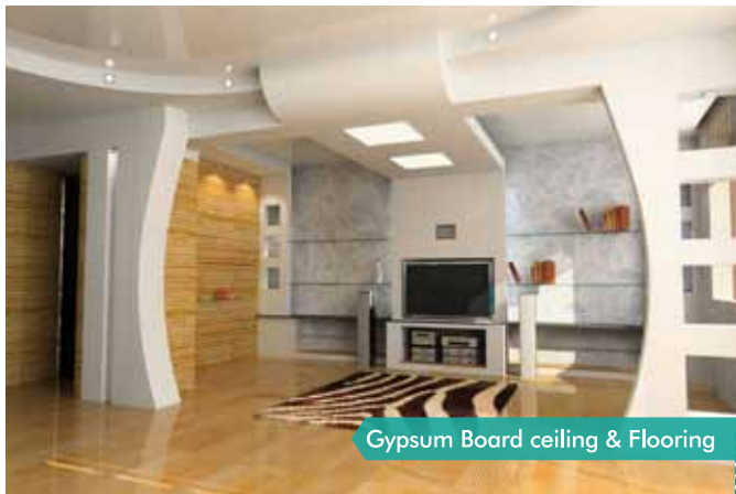
Gypsum Board ceiling & Flooring