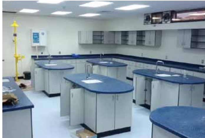
Cabinet(Labs & Toilets)

Understanding that there is a need for the restroom cubicle system the ability to tolerate heavy usage and deterioration, Formica USA Cubicle is crated, This restroom cubicle system functions under harsh conditions and remain as magnificent as ever, Integrating both nylon and aluminum materials in the construction, as the aesthetics of the restroom are brought to a new level.